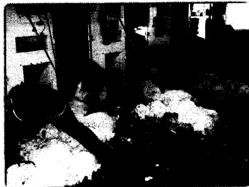
Grogansworth's three-year-old wethers being shorn last July